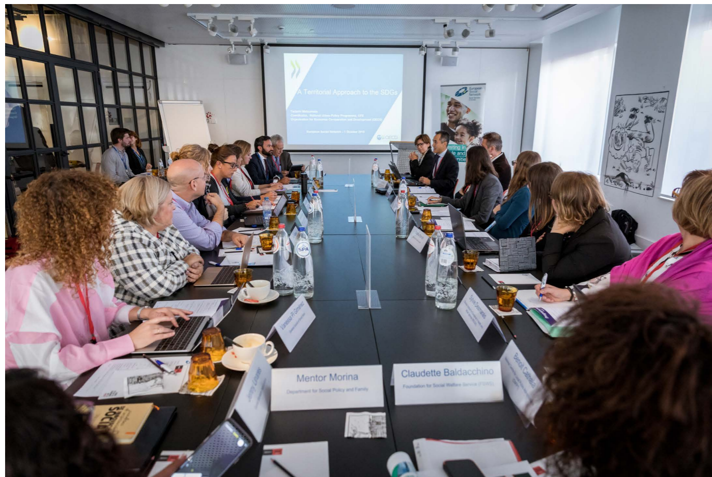
ESN's working group on the implementation of the Sustainable Development Goals, Brussels 2018

City social planning requires the commitment of all stakeholders to ensure that it is inclusive, integrated and sustainable. Cross-sectoral cooperation is of fundamental importance to create integrated city social strategies. There is furthermore the need to enhance evidence related to city social planning and be able to plan strategies with secure funding to increase their sustainability. Importantly, city social planning needs to be inclusive of the different stakeholders' views on relevant themes. While the implementation of successful city social planning may well face challenges, the involvement of social services is key in the development of city social planning strategies that are both inclusive and sustainable and contribute to the wellbeing of the whole population, leaving no one behind.